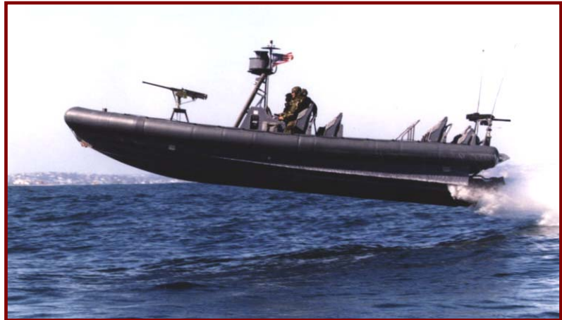
Figure 1. U. S. Naval Special Warfare Rigid Inflatable Boat

Advancements in high speed craft (HSC) construction and powering technology have led to ever-increasing craft speed and increasing numbers of reported impact injuries. The military HSC impact injury problem is particularly insidious since, unlike their high speed pleasure craft and offshore racing counterparts, military crewmen must operate their craft at high speed in rough seas to fulfill their mission and, at times, to survive. Further, as military craft crewmen are quick to remind us, they must "train as they fight." A critical objective within a human-centered approach to HSC acquisition is to reduce the incidence of impact injury.